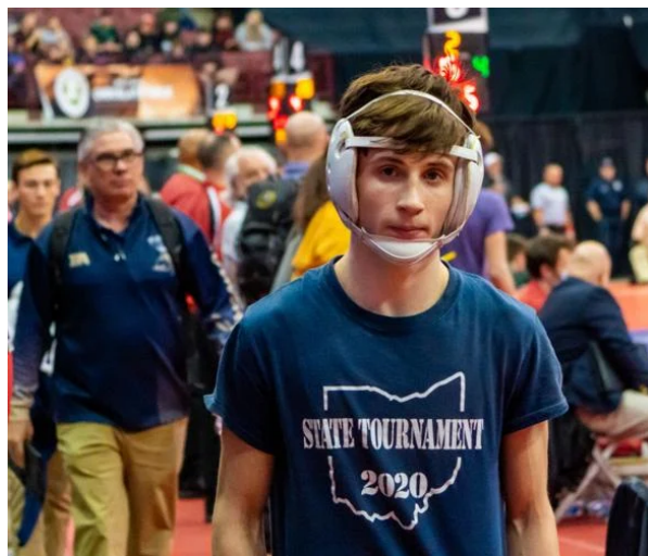
Havens at states